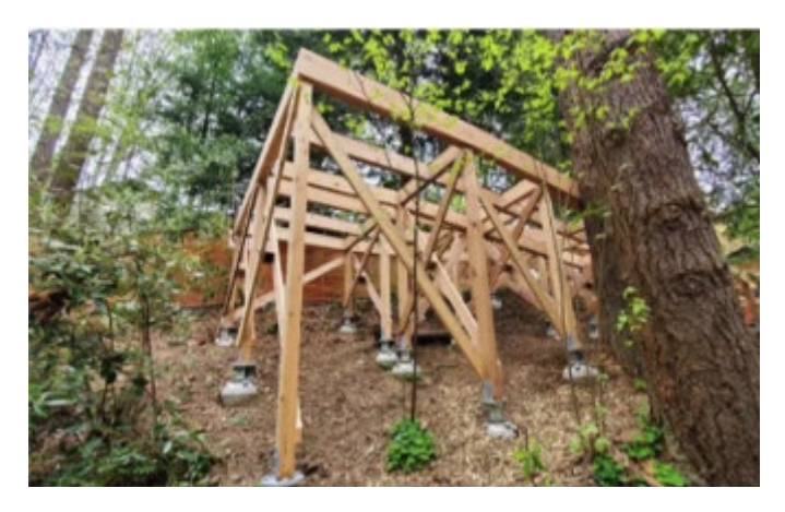
Tallest Extent of Walkway