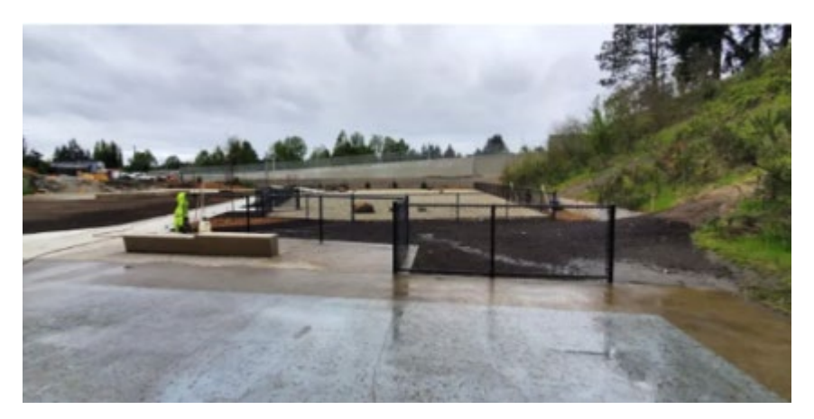
New Handball Court bench and fencing