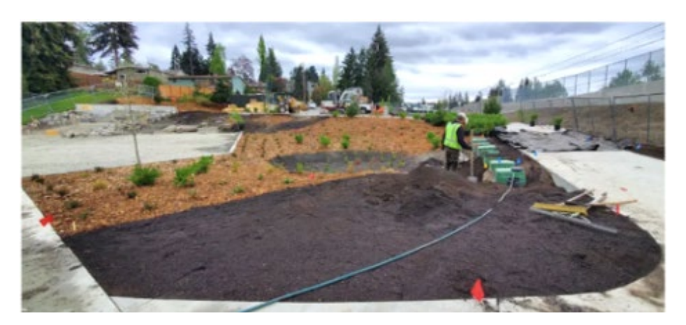
Loop path and plantings looking towards play area in background