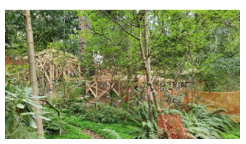
Walkway Blending in with Trees