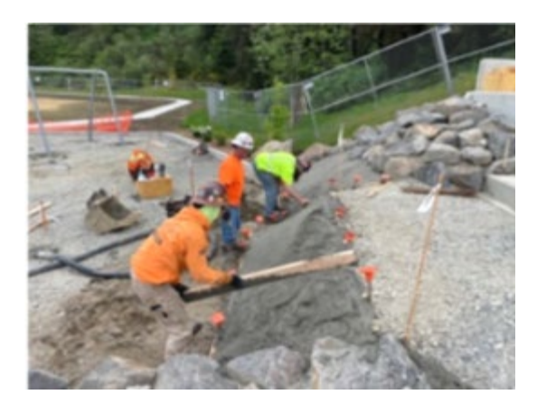
Play Area Concrete Install